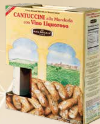
BSAN Cantuccini 250g & Dessert Wine 375ml

An Ensemble of delicious Organic products elegantly presented in a re-usable wooden case.