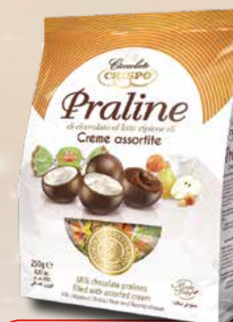
CRPA Praline Assorted 12*250 g