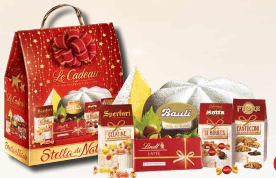
H2010 Stella di Natale 5 pcs Gift Bag