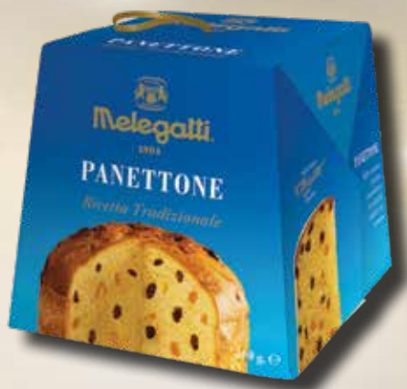
PNT04 Panettone Classico 18*500 g