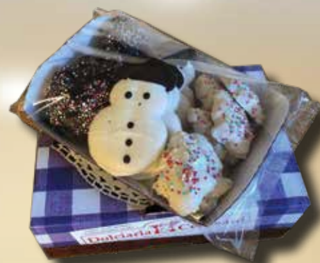
CERX Assorted Christmas Biscuits 1*500 g