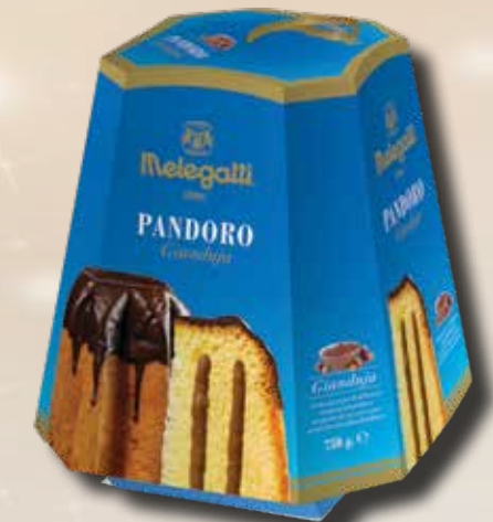
PRF04 Pandoro Gianduja 12*750 g