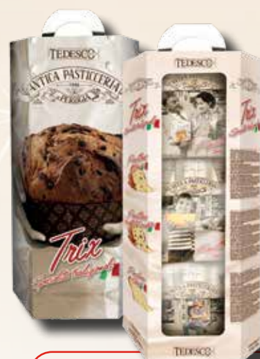
PS425 Piselli Trix 8*280 g

Traditional festive cakes available in MINIATURE ideally suited as a thoughtful gift or simply to be enjoyed as a festive snack!