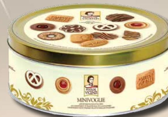
5497 Minivoglie Assorted Pastries Tin 12*350 g