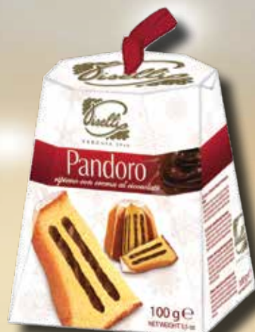
PS96 Mini Pandoro Chocolate 36*100 g