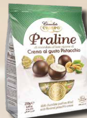
CRPP Praline Pistacchio 12*250 g