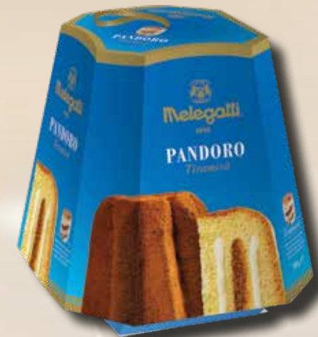
PRF02 Pandoro Tiramisu' 12*750 g