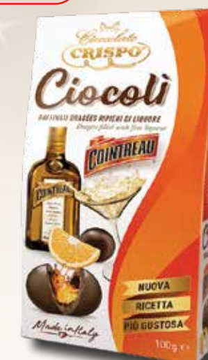
CRCO Ciocoli Cointreau 18*100g