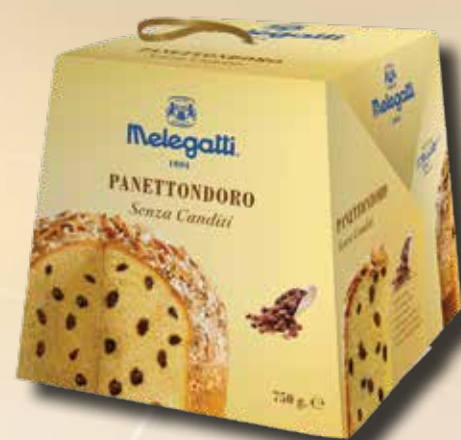
PNT12 Panettondoro no candied peel 12*750 g