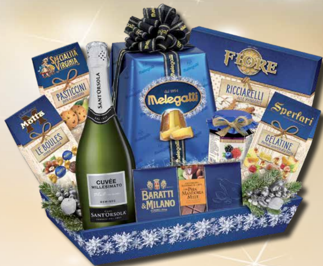
H2022 Vassoio Blu Cobalto 9 pcs Tray