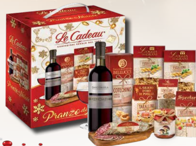
H2009 Pranzo di Natale 8 pcs Gift Box