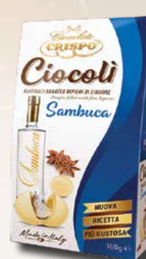
CRSB Ciocoli Sambuca 18*100 g

A fine selection of praline chocolates with a selection of liquor filled chocolate delights.