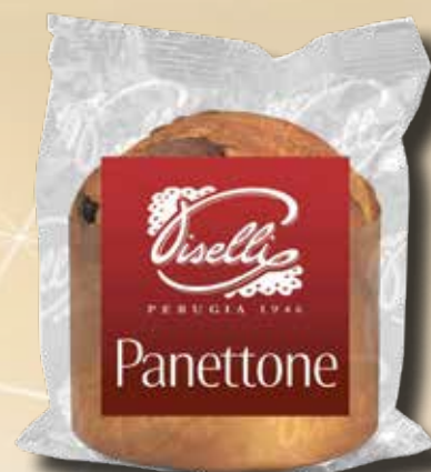
PI83 Mini Panettone Cellophane 48*100 g