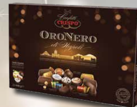
CROR Oro Nero Box 5*440 g