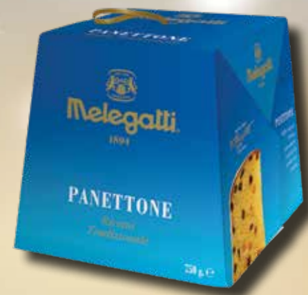
PNT02 Panettone Classico 12*750 g