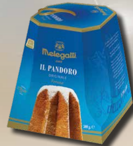
PRT04 Pandoro Classico 12*500 g