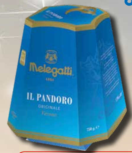
PRT02 Pandoro Classico 12*750 g