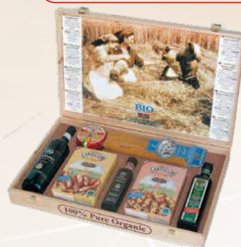
BCAS Wooden Case Organic Gift Set 7 pcs

An assortment of Italiane fine pastries packed in an elegant embossed gift tin.