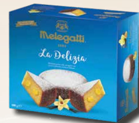
PRE01 La Delizia 18*400g