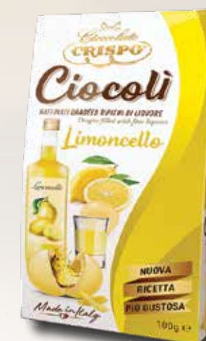
CRLI Ciocoli Limoncello 18*100 g