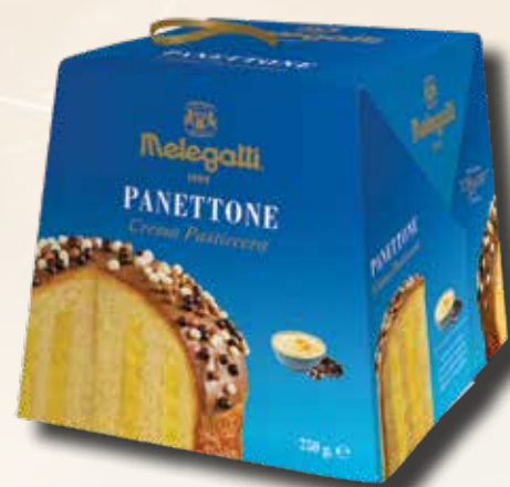
PNF05 Panettone Patisserie Cream 12*750 g