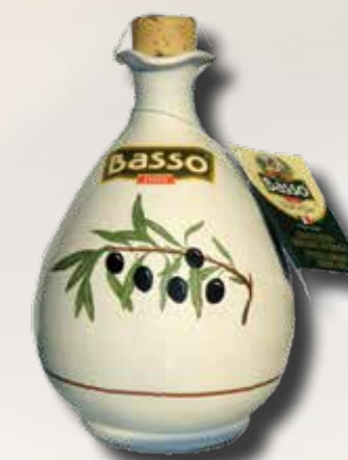
OBCJ Basso Ceramic Jar EVO 1*75cl

These oils represent the best Southern-Italian tradition, appreciated by the most discerning consumers because they enhance the flavour and taste of every dish.