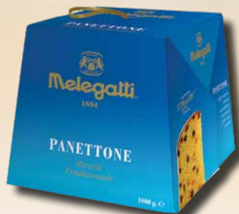
PNT01 Panettone Classico 12*1000 g