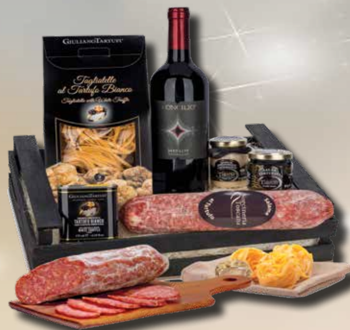
H437 Il Re Tartufo 7 pcs Wooden Case