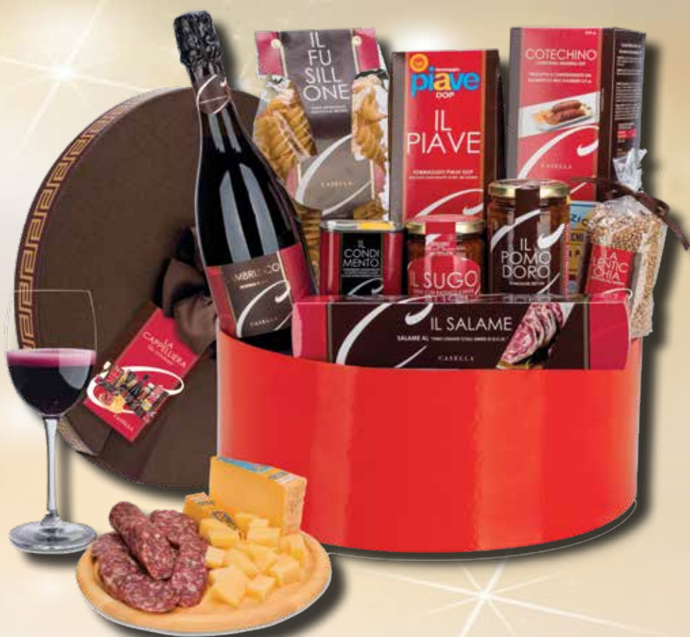
H705 La Cappelliera del Gourmet 10 pcs Elegant Hatbox with Ribbon