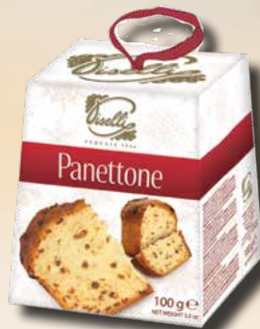
PS37 Mini Panettone Classico 36*100 g