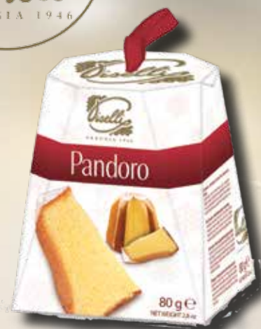
PS77 Mini Pandoro Classico 36*80 g