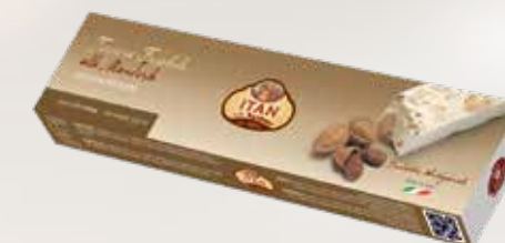
096 Traditional White Almond Nougat 20*100g