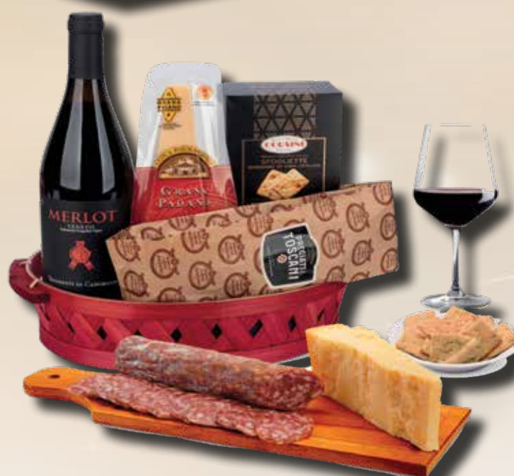
H662 Cestino dell'Amicizia 5 pcs Bamboo Basket