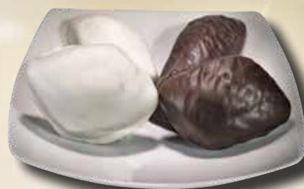
5197 Mostaccioli 12*300 g