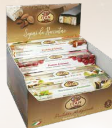
102 Assorted Soft Nougat 20*100 g