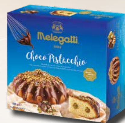
PRE11 Choco Pistacchio 18*400g