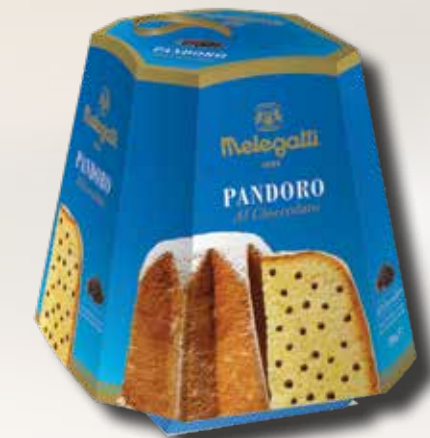
PRF001 Pandoro Chocolate Chip 12*750 g