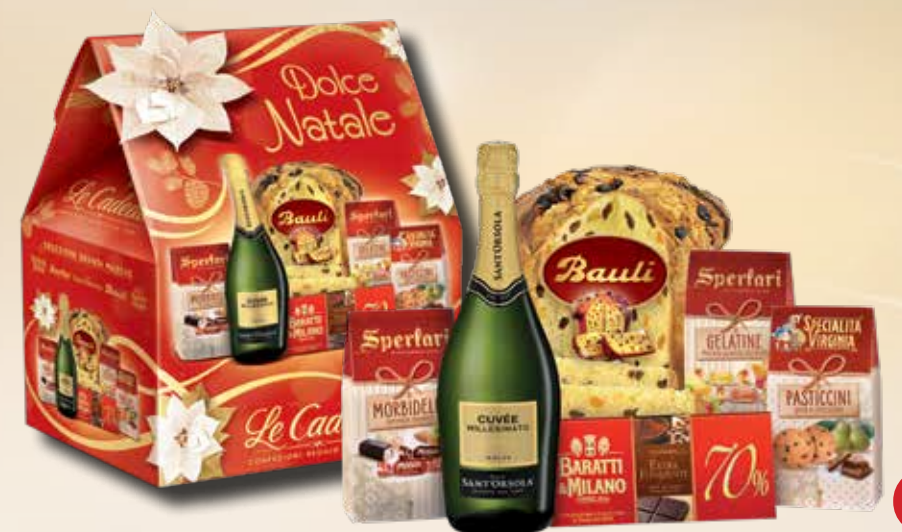
H2012 Dolce Natale Panettone 6 pcs Gift Box