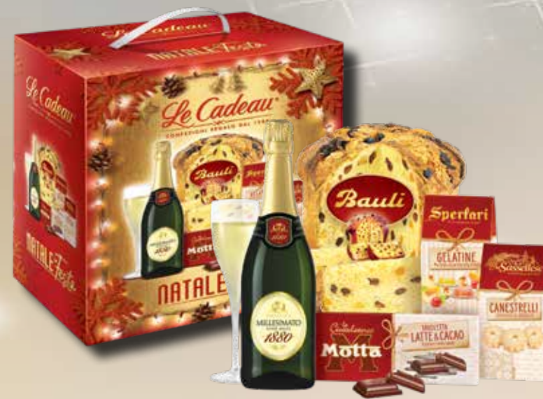
H2005 Natale in Festa Panettone 5 pcs Gift Box