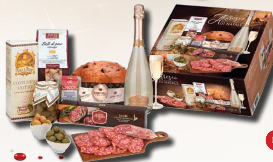
H621 Affresco di Natatle 7 pcs Box