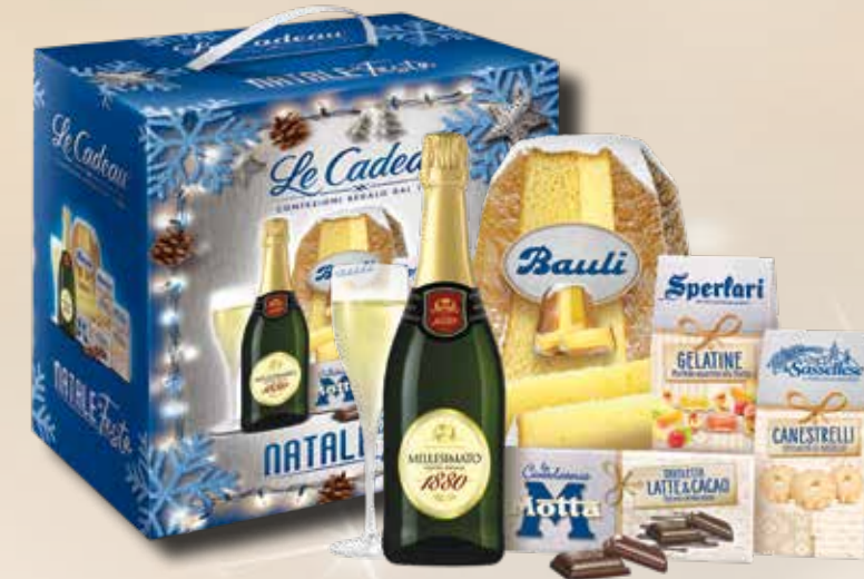
H2008 Natale in Festa Pandoro 5 pcs Gift Box