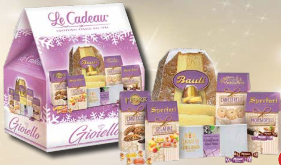
H2015 Gioiello 6 pcs Gift Box