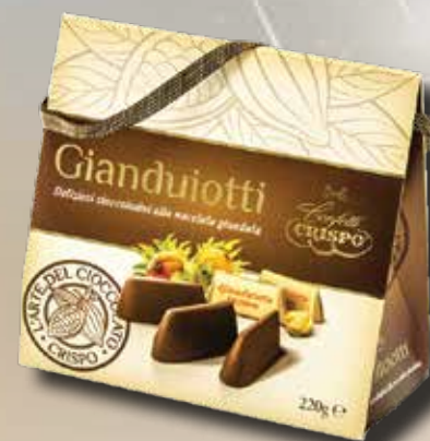
SLEM Gianduiotti Bag 6*220 g