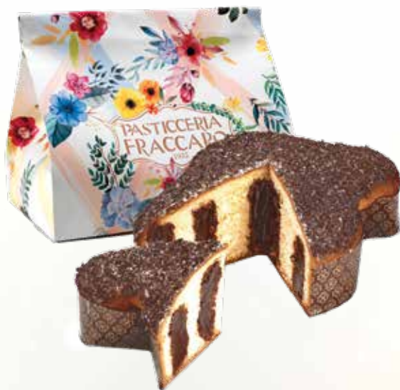
250BA Colomba Gianduja 8*750g