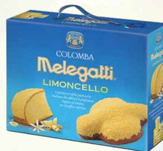
CBF005CR Colomba Limoncello 15* 750g