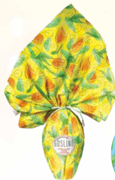
F527 Dark Chocolate Eggs* 8* 500g