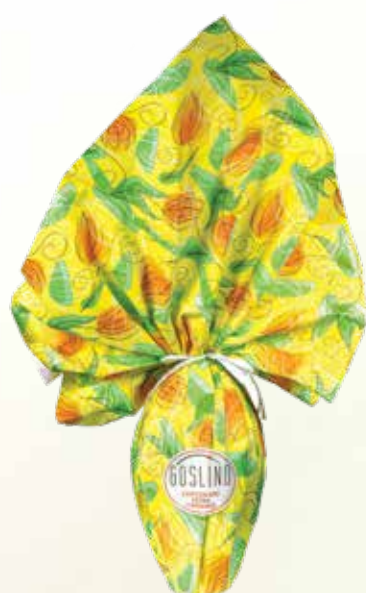
L528 Milk Chocolate Eggs 4* 750g