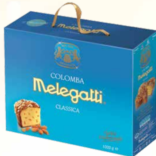
CBA003VS Colomba Classica 14* 1000g