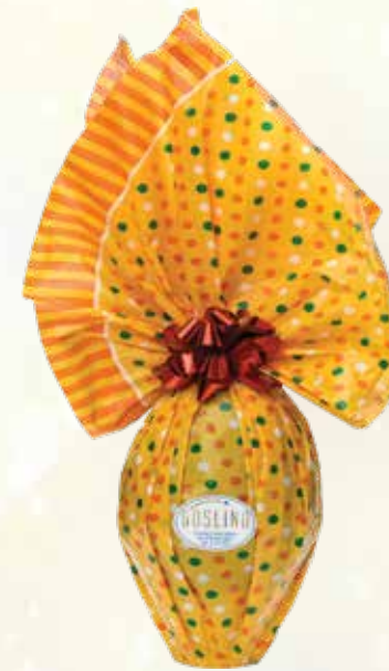
L525 Milk Chocolate Egg 1* 1000g