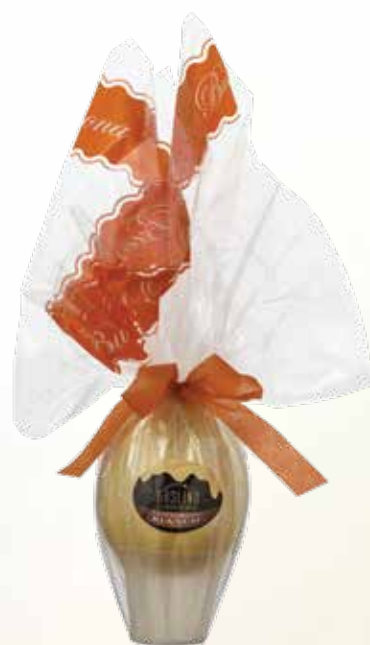
W37 White Chocolate Eggs 8* 350g