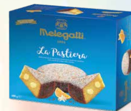
PRE003VS La Pastiera 18* 400g