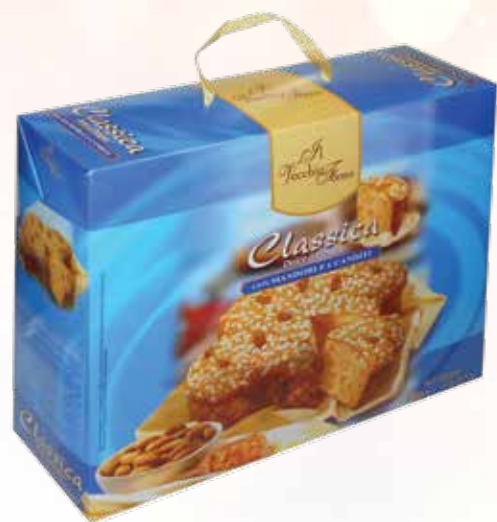
CO789 Colomba Classica 11*900g