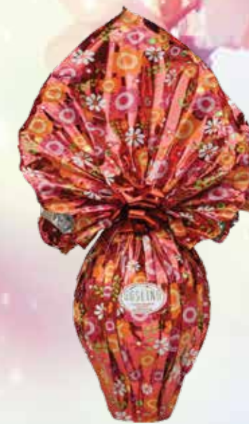
L205 Milk Chocolate Egg 1* 2000g