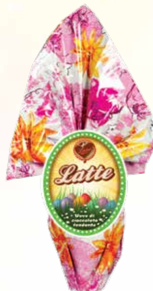
5001 Milk Chocolate Eggs 13* 250g