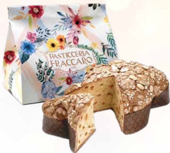
222BA Colomba Classica 8*750g