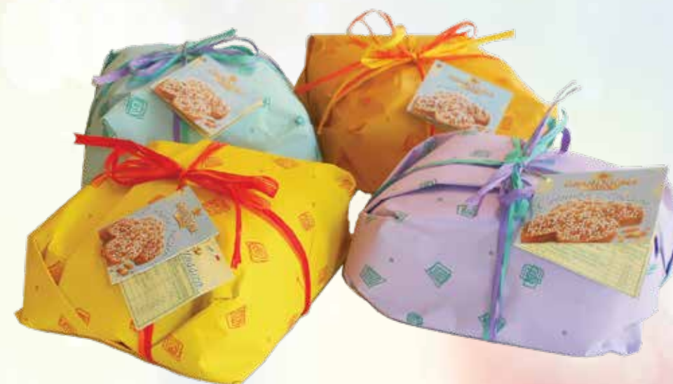
CO677 Colomba Classica hand wrapped in assorted colours 7*900g

A selection of traditional Italian Dove shaped Easter Cakes, hand wrapped in elegant pastel colours. Colombe are traditionally given as gifts at Easter as a sign of peace. An exquisite all butter cake topped with almonds, sugar granules and filled with finely selected candied fruits that can be enjoyed during this festive occasion.