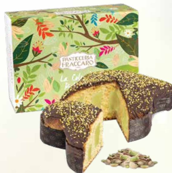
NEW 271SC Colomba Pistacchio Gift Box 8*750g