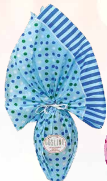
F526 Dark Chocolate Eggs * 8* 350g