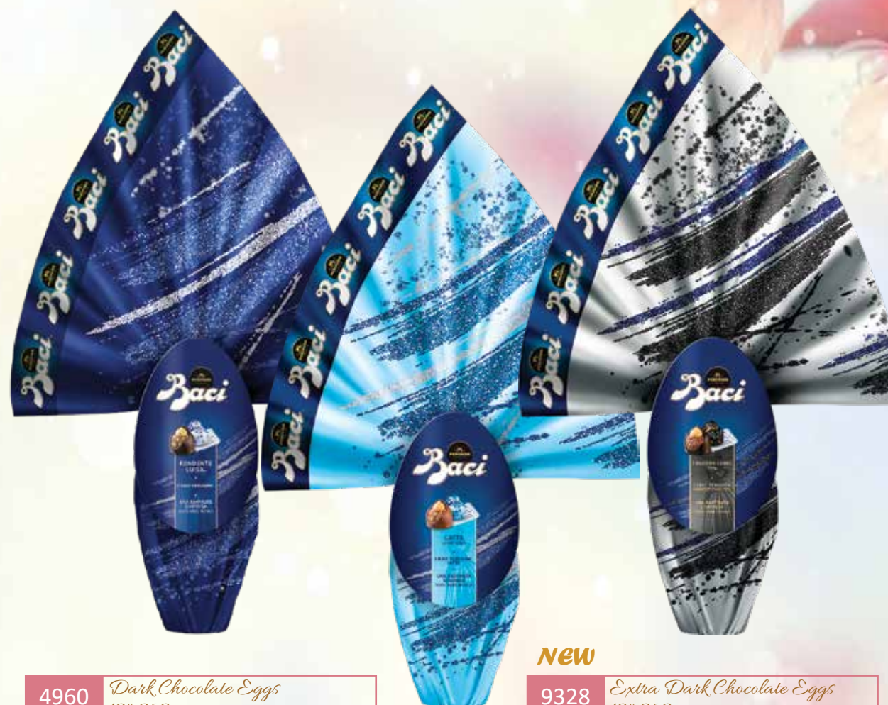
4960 Dark Chocolate Eggs 12* 252g