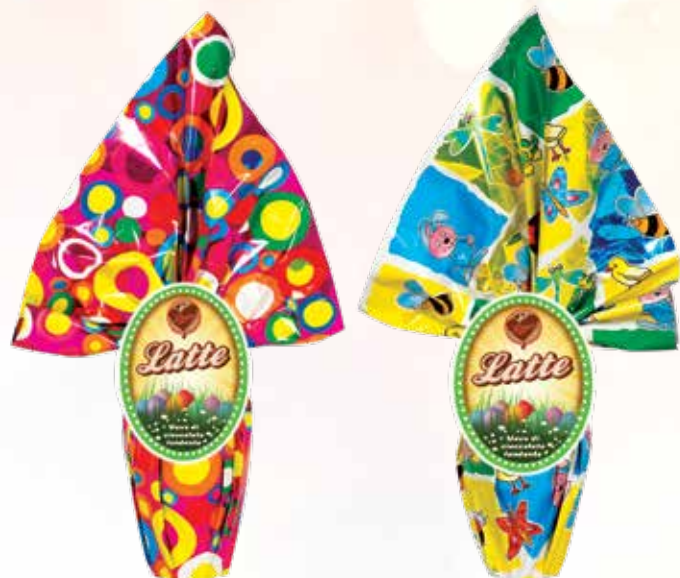
L5000 Milk Chocolate Egg 5* 28*100g