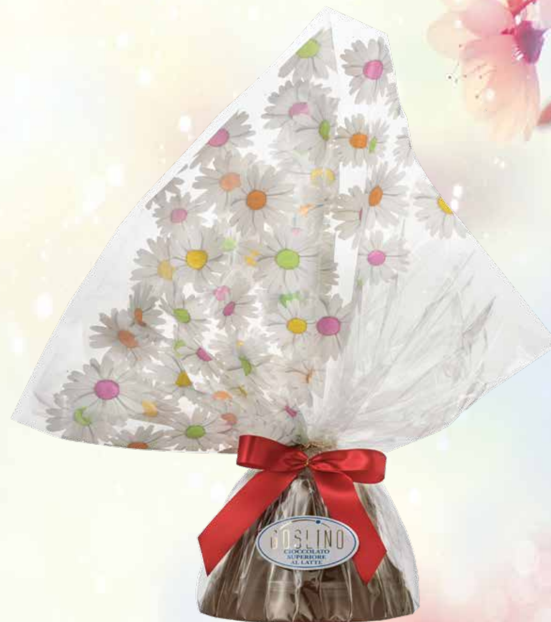
L1067 Milk Chocolate Bells* 8* 350g