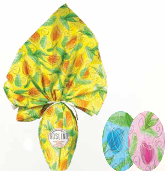
L523 Milk Chocolate Eggs* 8* 500g