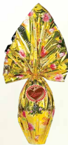
L102 Milk Chocolate Egg 1* 2000g