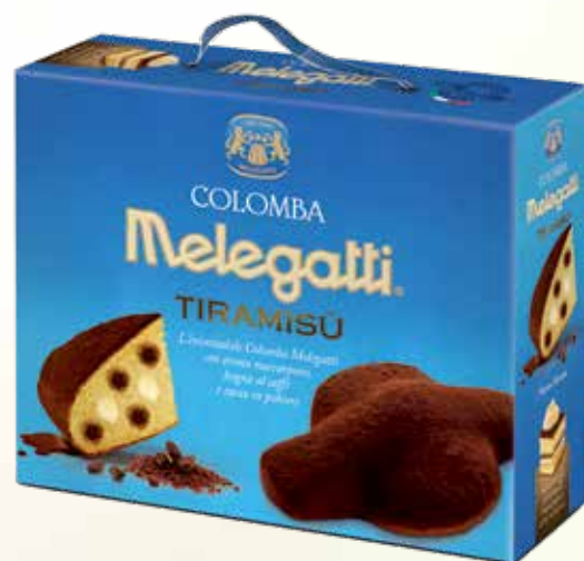
CBF004CR Colomba Tiramisu 15* 750g