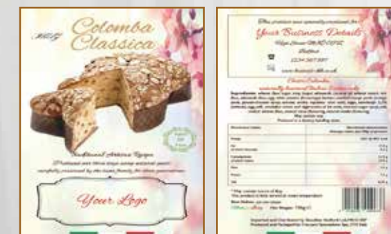
OWNC Colomba Classica Own Label hand-wrapped 6*750g

* Logos must be provided in jpeg, high definition format.