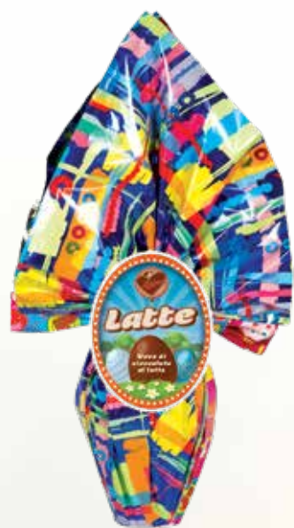
5003 Milk Chocolate Eggs 7* 500g