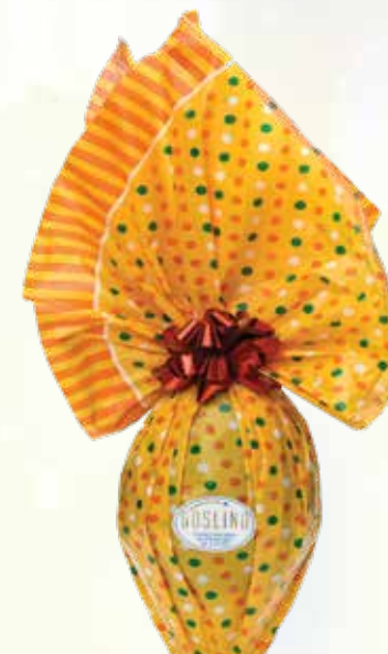
F213 Dark Chocolate Egg 1* 7000g