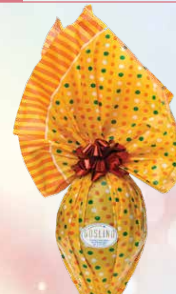
F529 Dark Chocolate Egg 1* 1000g