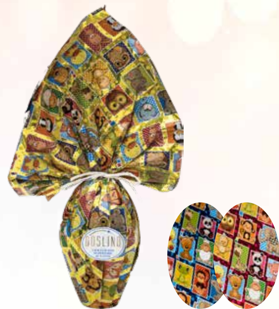
L500 Milk Chocolate Eggs * 18* 220g