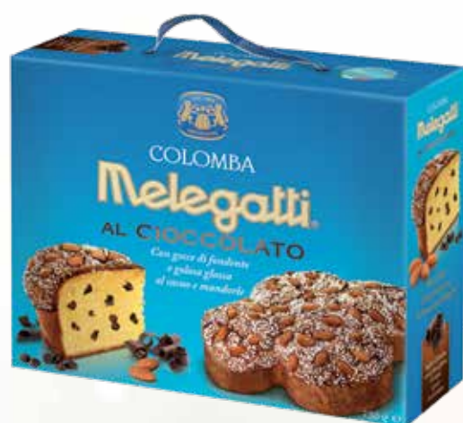
CBF002CR Colomba Chocolate 15* 750g