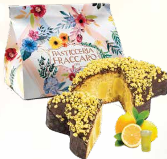
287BA Colomba Limoncello 8*750g