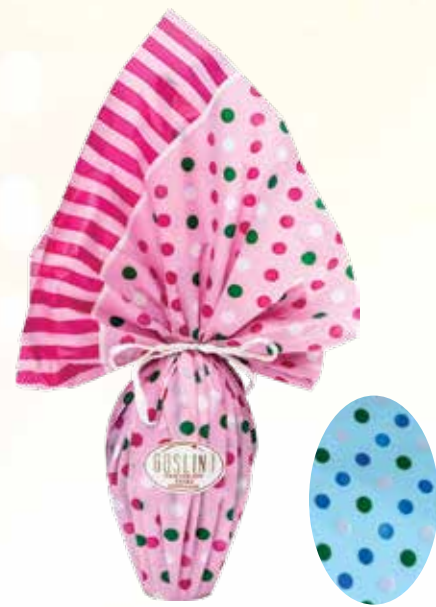
L522 Milk Chocolate Eggs * 8* 350g